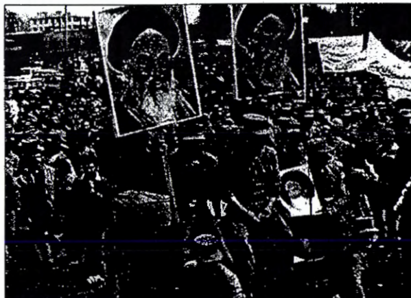
The Iranian Islamic Republic Army demonstrates in solidarity with people in the street during the Iranian revolution.

Iran's unique achievement is that its movement for freedom was beholden to neither superpower. It was led by a Muttaqai alim (pious scholar), Imam Khomeini, whose understanding and learning of the global situation was rooted in the values and teachings of Islam.