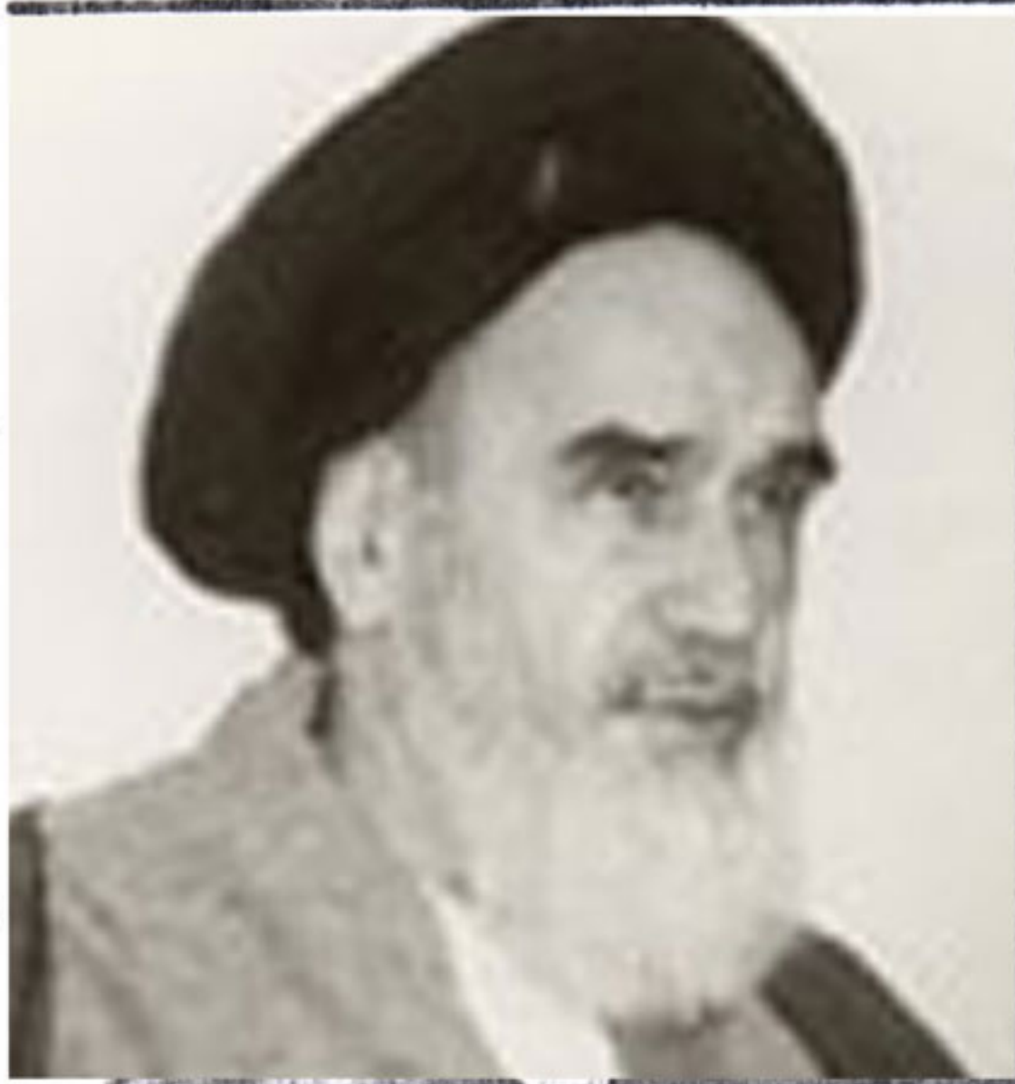
In the Name of God, the Merciful, the Compassionate

I congratulate the oppressed people of the world, the Muslims and the honorable and brave nation of Iran on the anniversary of the victory of the great Iranian Revolution. On such an auspicious day Right conquered Wrong, God's soldiers conquered the friends of Satan and the Hizbu-l-Lah [party of God] conquered Satan and his followers. The Islamic government held sway; the vengeful hand of God working through the combatant Iranian nation and the marvelous victory of Islam over atheism was fulfilled. On such a happy occasion the solidarity of all sects of the brave nation increases from day to day. The Army and other forces proved their loyalty to Islam and Iran and rescued their country from the devils of the time at whose head is the U.S. government. Greetings be upon such an alert nation and praise be upon the disciplinary forces, the Islamic Revolutionary Guards Corps. Long live the glorious banner of Allahu Akbar which is the secret of the miraculous victory of the great Iranian nation. The great victory established the foundations of an Islamic Republic within just a year and brought about the annihilation of the oppressors, a thing which has not been achieved in non-Islamic revolutions for many years. Our dear nation succeeded in achieving within one year under the protection of Islam and with the least damage what other revolutions achieved with the killing and imprisonment of